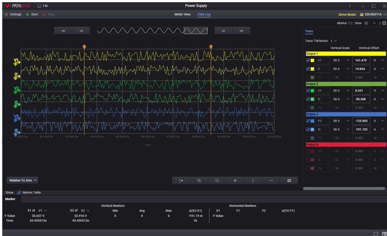
Figure 3. Data-logging with PathWave Benchvue software for the PC